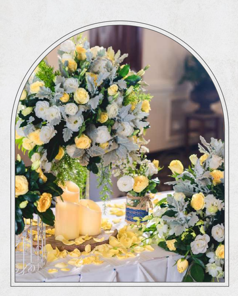
WEDDING & EVENTS